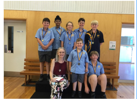
5/6 BOYS BASKETBALL