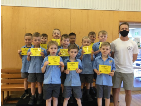
TERM 1 KANGA CRICKET SKILLS