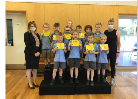
TERM 4 KANGA CRICKET SKILLS