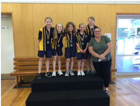
2/3 GIRLS BASKETBALL