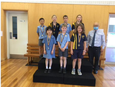
2/3 MIXED BASKETBALL