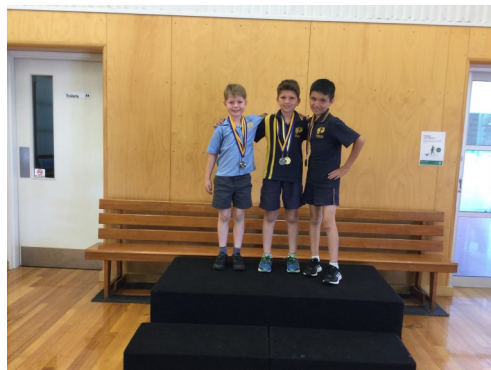
C&B GRADE CRICKET