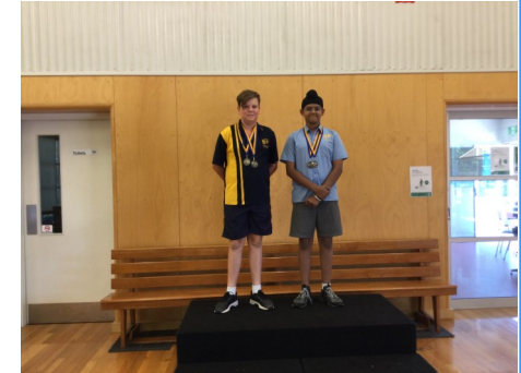
2&3 MASTER BLASTER CRICKET